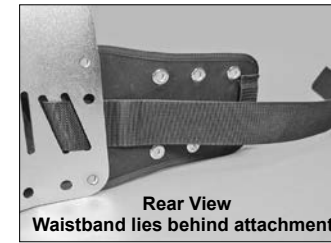
Rear View Waistband lies behind attachment

2. Align the two mounting holes at the side end of the SureLock attachment with the mounting holes on the lower side of the plate (Figs. 1 & 2). The attachment mounts to the front of plate. The waistband attachment loop faces the back of the plate, with the waistband of the harness behind the SureLock attachment (Fig. 3). Insert the washer, small diameter first, into the mounting hole on the back of the plate followed by the threaded barrel (Fig. 4).