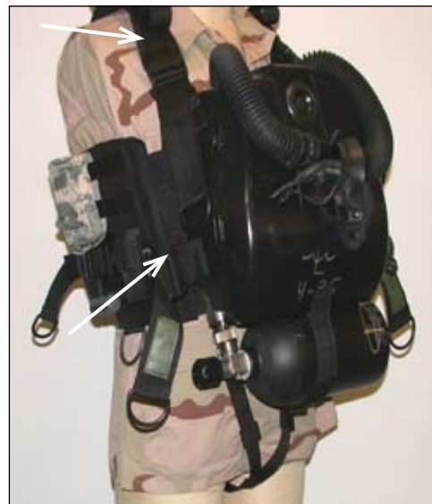
CSH with MK-25 attached