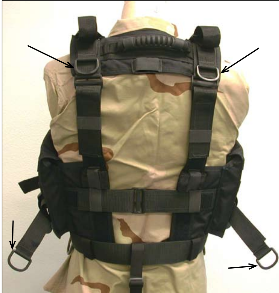
Equipment attachment points