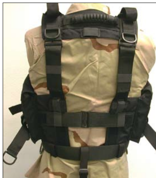
CSH rear view