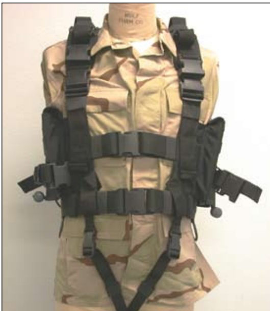
CSH front view