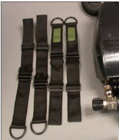
MK-25 with Strap Kit P/N 769005