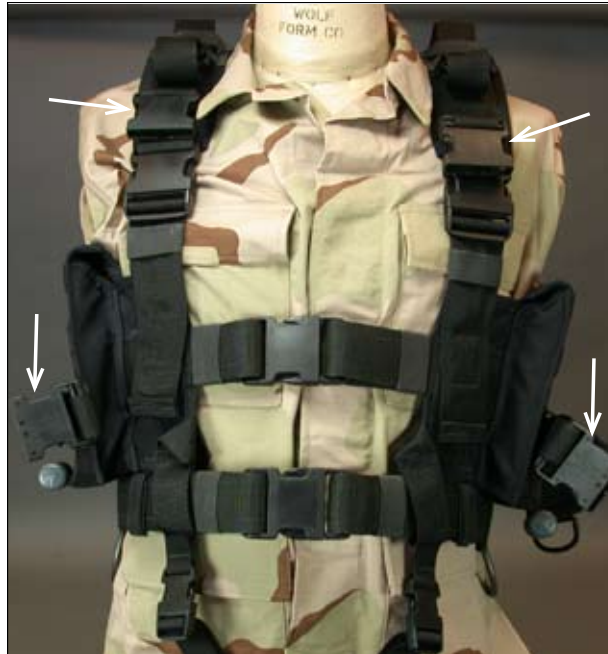
MK-25 attachment points