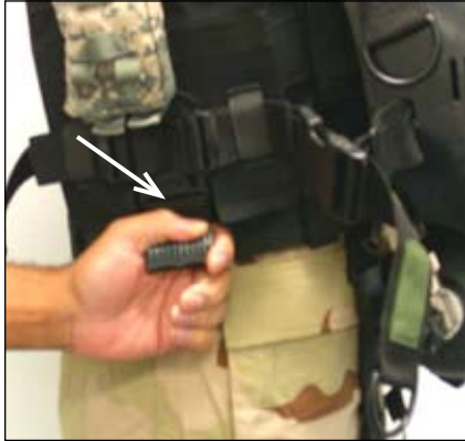
SureLock™ Weight System