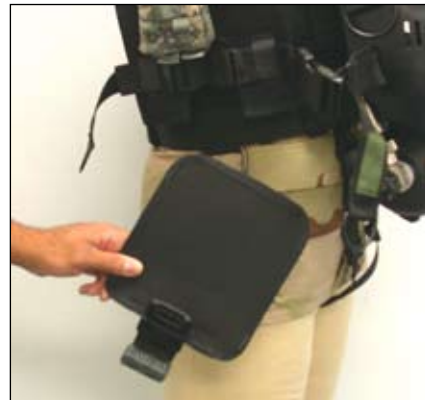
SureLock™ Weight Pouch Removed