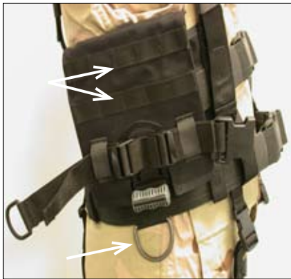
Molle straps and D-rings provide attachment points for small Molle style pockets and equipment