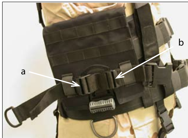
Equipment attachment adjustment points (a) MK-25 lower harness adjustment points (b)