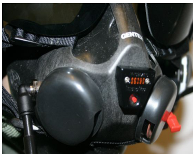
Optional PHODS oxygen mask