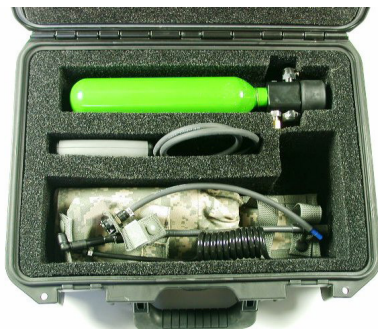
PHODS is packaged in an environmentally sealed storage case