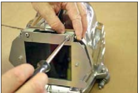
Step 4: Secure and tighten left and right hinge block mounting screws to 45 in.lbs (5 Nm).