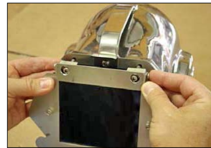
Step 3: Line up welding lens.