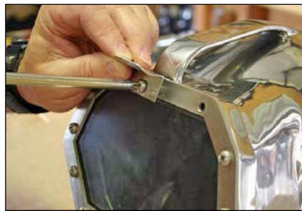
Step 2: Install shield welding spring.