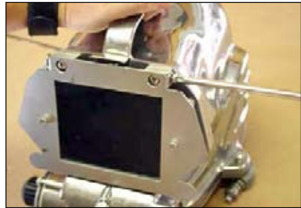
Step 5: Secure and tighten left and right hinge screws to 45 in.lbs (5 Nm).