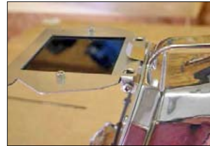
Step 6: Confirm welding shield opens and closes correctly.