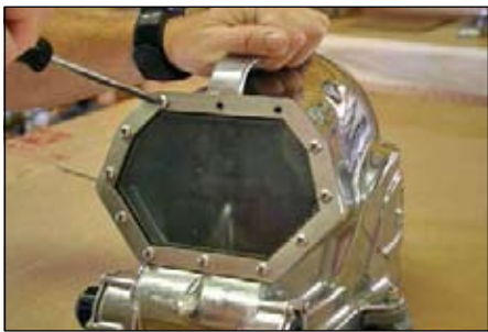
Step 1: Use a Phillips # 3 screwdriver to remove three retainer port screws from top of helmet retainer port.