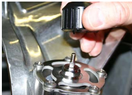
Step 2: Remove Knob, Spring and Nut