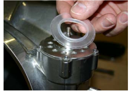
Step 9: Place Flapper Valve onto the Seat. Do NOT lubricate