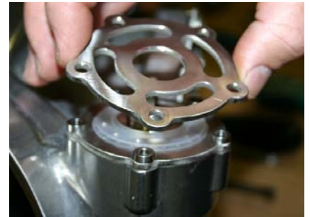
Step 12: Place Valve Exhaust Cover on top of Spacer Rings