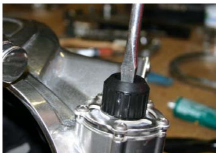
Step 16: Tighten Nut until snug