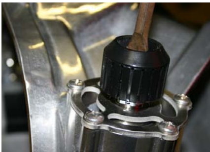
Step 1: Unscrew Free Flow Knob