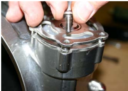
Step 13: Insert all Screws and run in by hand