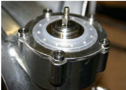
Step 11: Spacer Rings in place