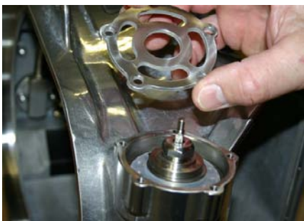
Step 4: Remove Valve Exhaust Cover