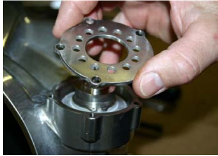
Step 8: Place Exhaust Seat over Bushing