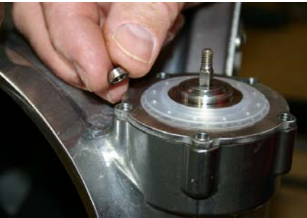
Step 10: Place all Spacer Rings onto the Seat