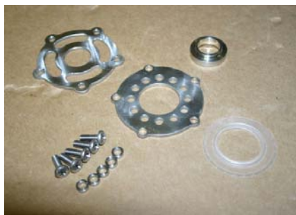
Step 5: Parts Breakdown for Double Exhaust conversion