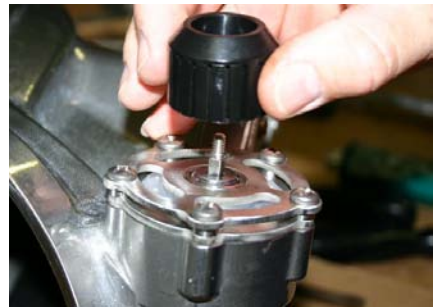
Step 15: Replace Knob, Spring and Nut