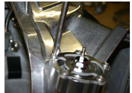
Step 3: Unscrew Valve Exhaust Cover screws