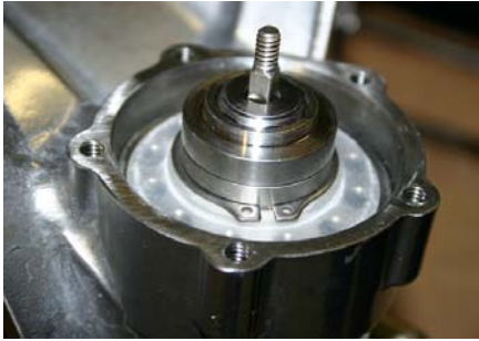
Step 7: Exhaust Bushing installed