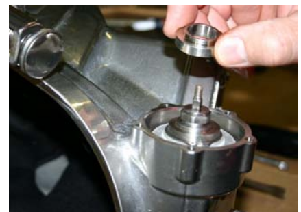
Step 6: Place Exhaust Bushing over Valve Stem and Bonnet