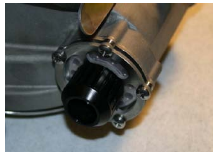
Step 17: Double Exhaust installed