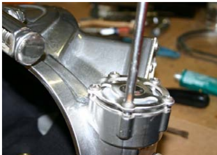
Step 14: Tighten Screws using a Phillips screwdriver until snug