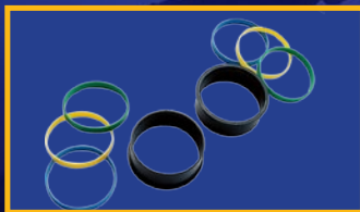
Removable Wrist Rings.