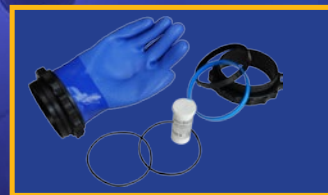
Commercial Gloves with Glove Rings.