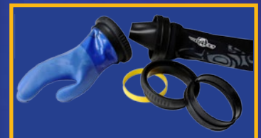
Removable Glove Lock System.