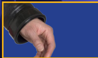
Permanent Wrist Rings.