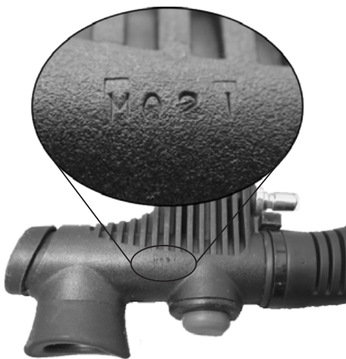
Fig. 2 - Serial number stamp

If you have a spiral hose that falls within the serial number range, please have the hose replaced by this authorized Aqua Lung retailer.