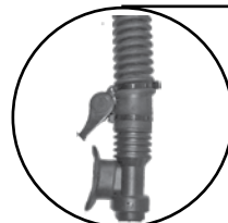
Military Oral Inflator