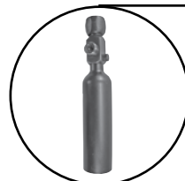
1.5 cf auxiliary air cylinder with valve