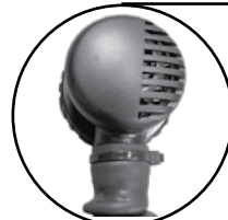
Rapid Exhaust Valve (Rev) Over Pressure Relief Valve (OPRV)