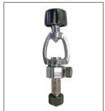
Tank Fill Adaptor