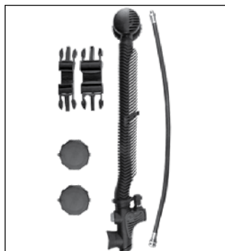
Open Circuit Kit